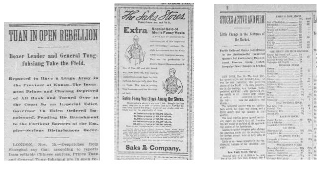
Fig. 6. : Three examples of newspaper structures that can facilitate automated processing. In the article on left, note the distinctive layout and fonts. In the advertisement, center, note the dark border. For the stock reports on the right, note the distinctive tabular structure.

This consistent way of formatting news articles is helpful in discriminating articles that are not news. There are many medical cures advertised that try to pass for news articles but lack the formatting particular to news articles.. Also, as the Washington Times fills the entire column, many very small articles are included in its pages. Typically, these are a one-to-three sentence excerpts from other newspapers; these excerpts are consistently formatted as well.