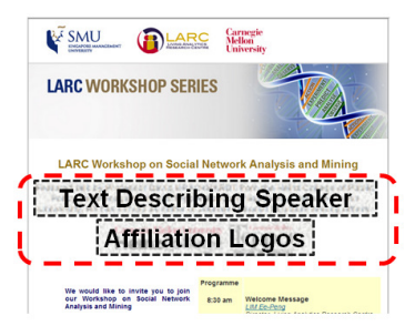
Figure 2: Event page with the authority message (red box)